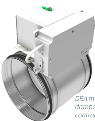
DBA mounted on a circular damper with its associated controller mounted on its motor cover.