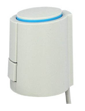
Valve actuator A41405 without adapter ring.