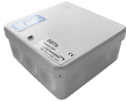
SBTb - Valve actuator controller.